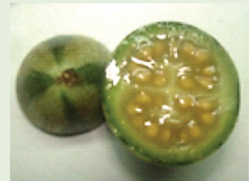
Mature fruits for this species have juicy, yellow flesh with fully developed seeds ready for collection