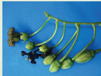
Flowers with very young fruits in the same inflorescence