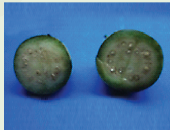
For this species, a transverse section reveals differences between mature and immature fruits. Here, an immature fruit has a hard, white flesh with underdeveloped seeds