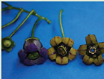
Flowers at different stages of maturity