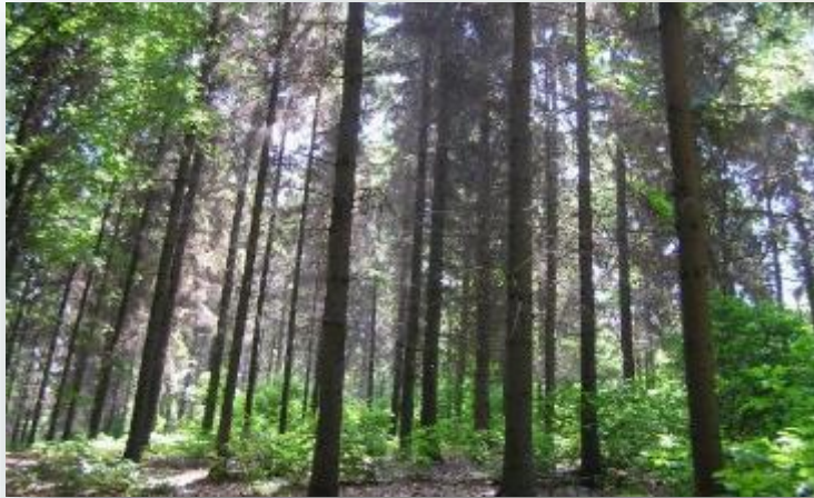
Coniferous forest belt in the Carpathians area

Beginning in 1944, botanical and geographical areas were created in the Botanical Garden: "Far East"; "Central Asia"; "Caucasus"; "Altai and Western Siberia"; "Crimea"; "Steppes of Ukraine"; "Ukrainian Carpathian Mountains"; "Forests of the plain part of Ukraine".