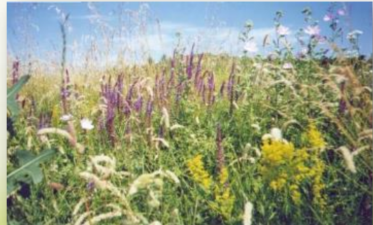
Meadow-steppe weeds in the area "Steppes of Ukraine"