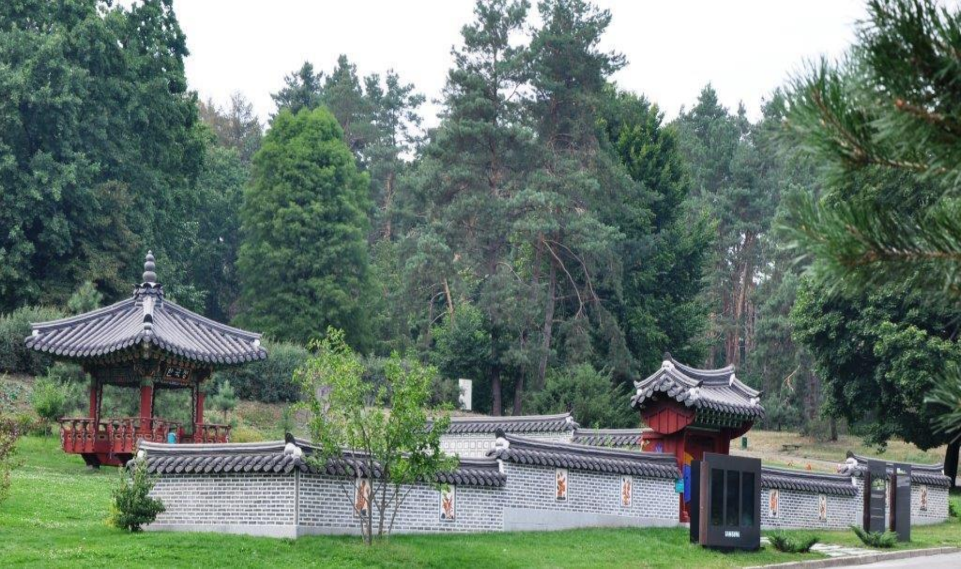
Korean Traditional Garden