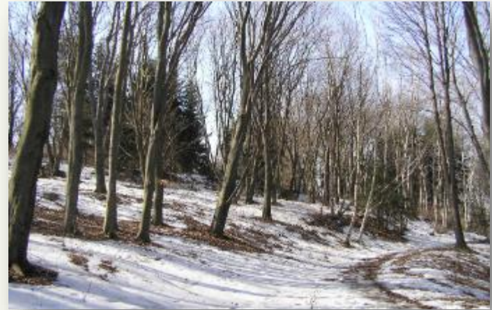
Beech forest belt in the Caucasus area