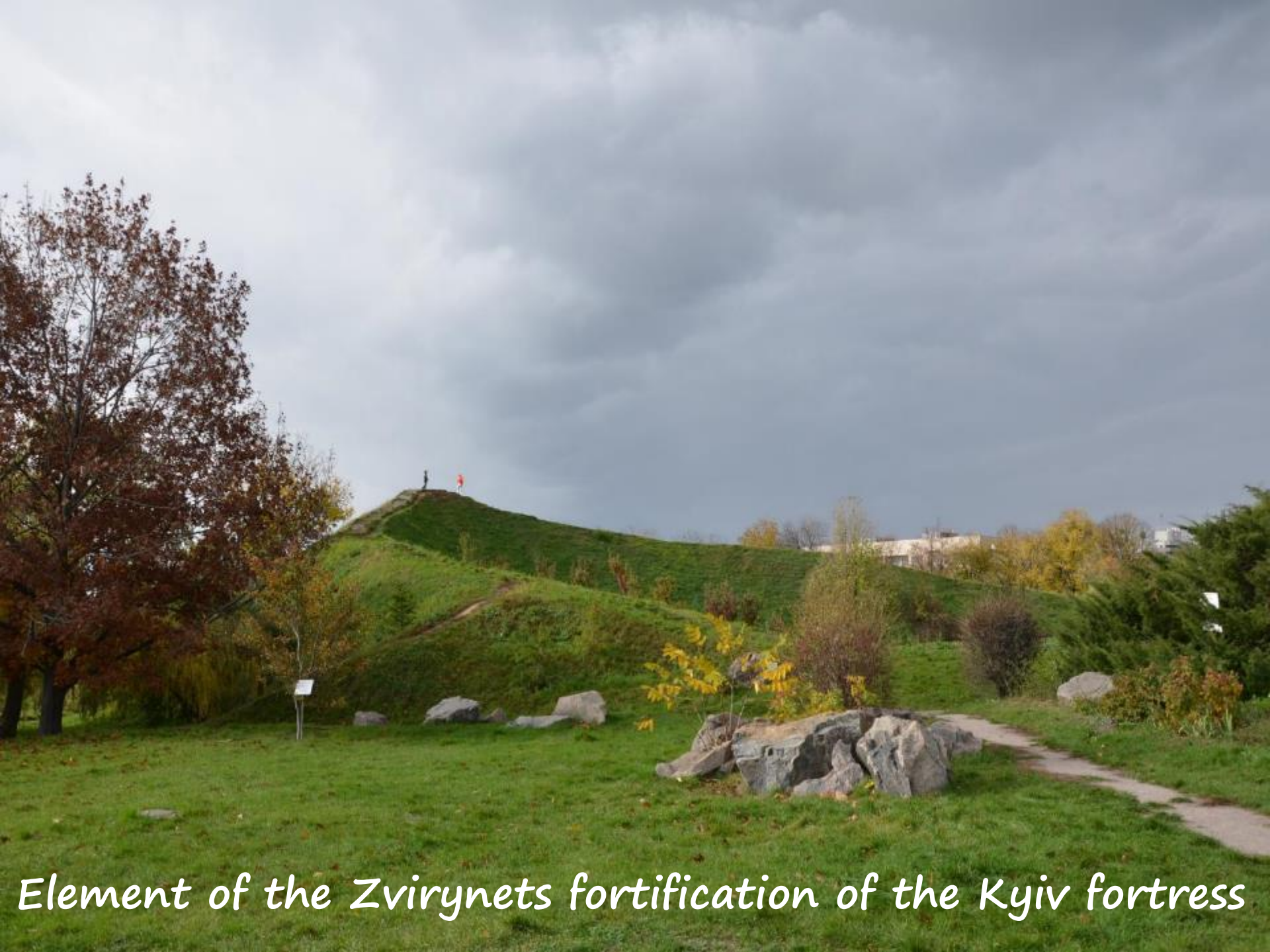
Element of the Zvirynets fortification of the Kyiv fortress