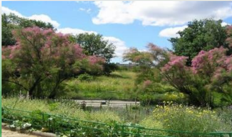
Tamarix blooms in the Crimea