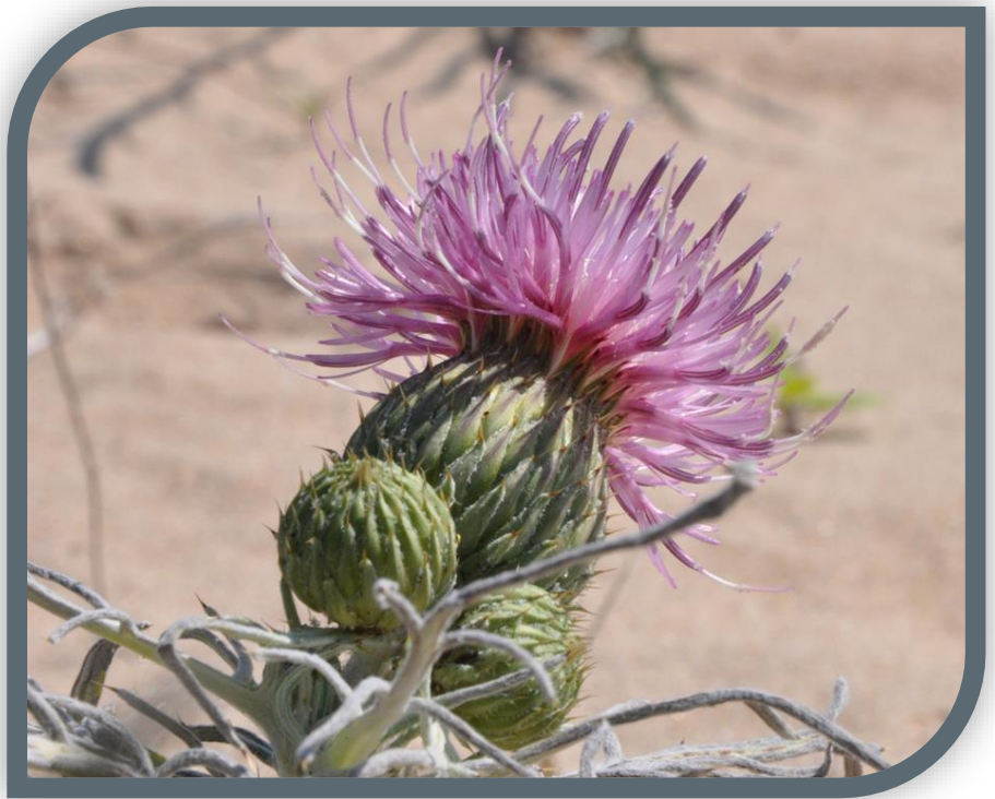
Rare magenta form of Pitcher's thistle ( Cirsium pitcheri )