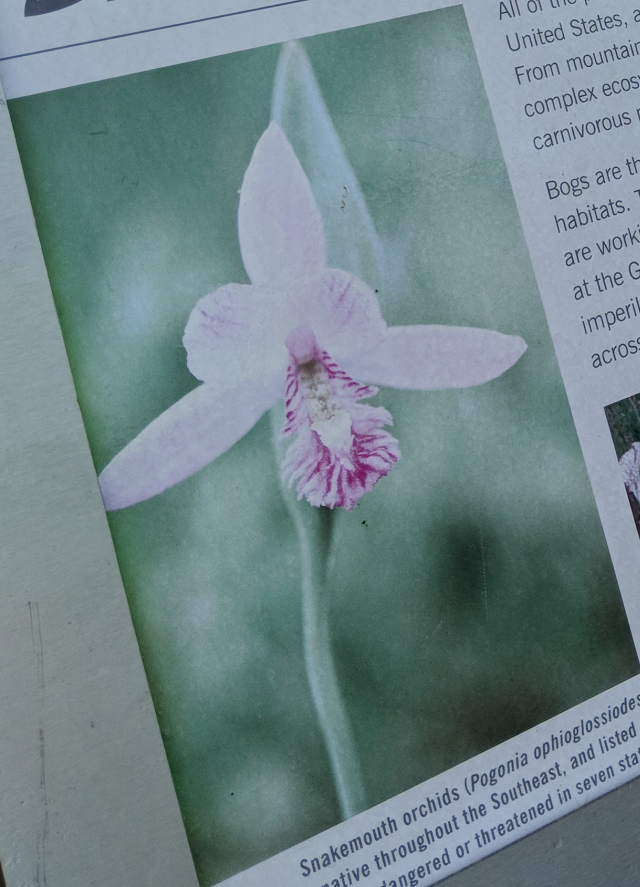
Snakemouth orchids ( Pogonia ophioglossoides ) are native throughout the Southeast, and listed as endangered or threatened in seven states.

All of the plants in this garden are native to the southeastern United States, and many are found nowhere else in the world. From mountain valleys to coastal floodplains, southeastern bogs are complex ecosystems that support a rich diversity of life, including carnivorous plants and several species of native orchids.