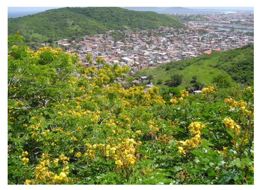
Fig 2 View of the City of Cabo Frio (Jacaré community) from the Morro do Mico, one of the last urban remnants of brazilianwood (Caesalpinia echinata Lam.).