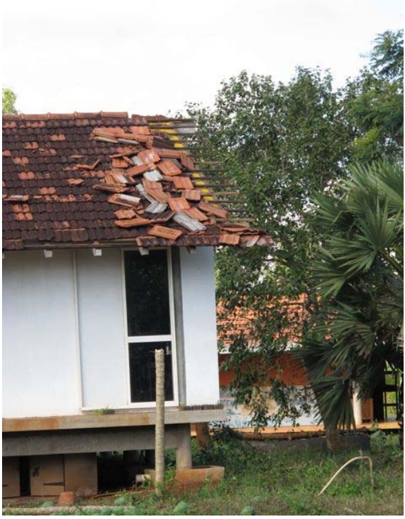
The Seed Room Roof damaged