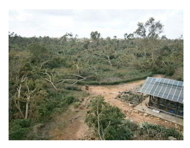
Devastation around the cactus house