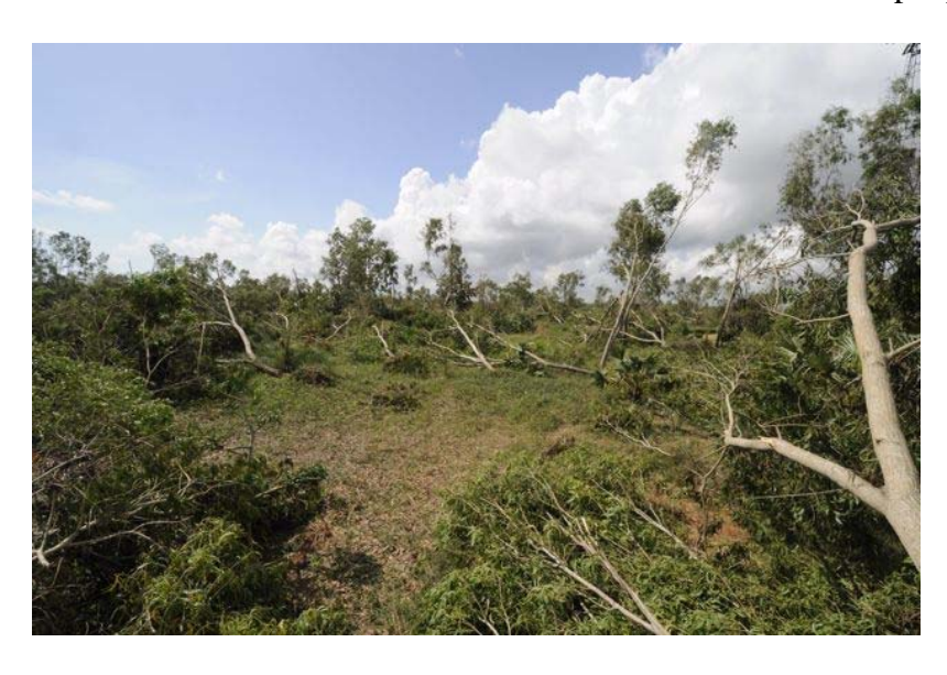
At the center of the Arboretum