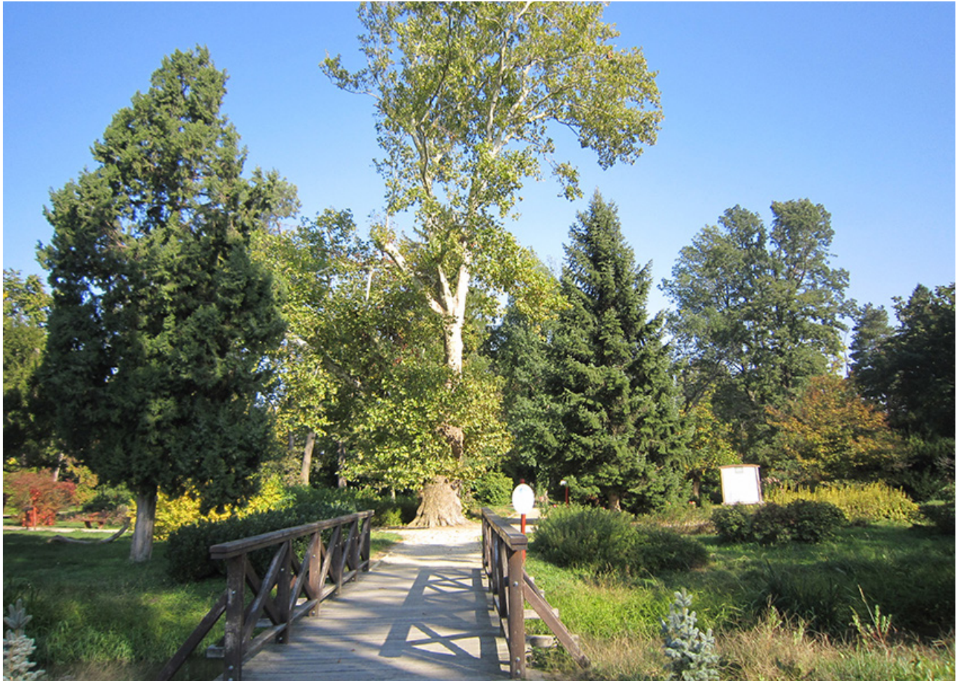
Kámoni Arboretum, Szombathely