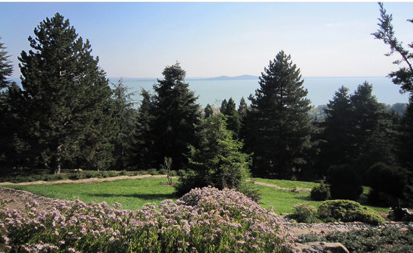
Folly Arboretum, Lake Balaton