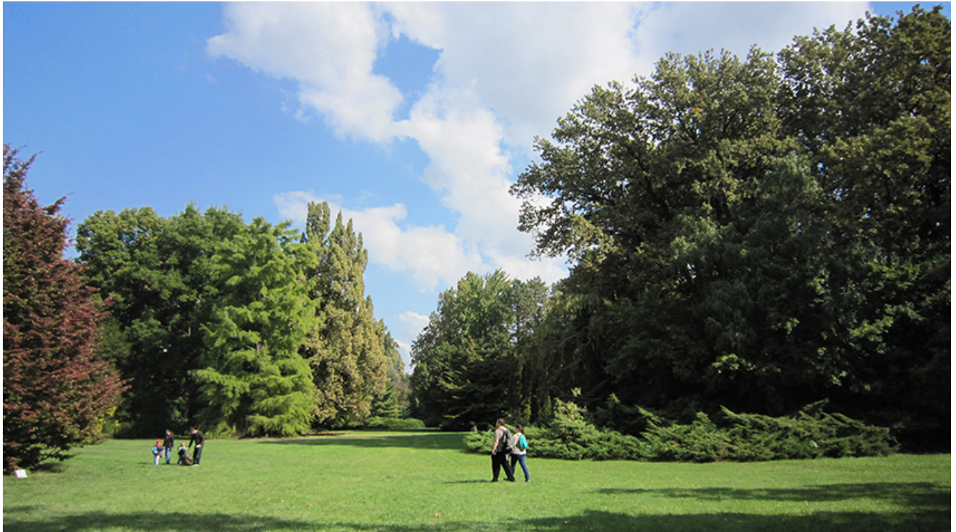
Szarvasi Arboretum/ 'Pepi-kert', Szarvas