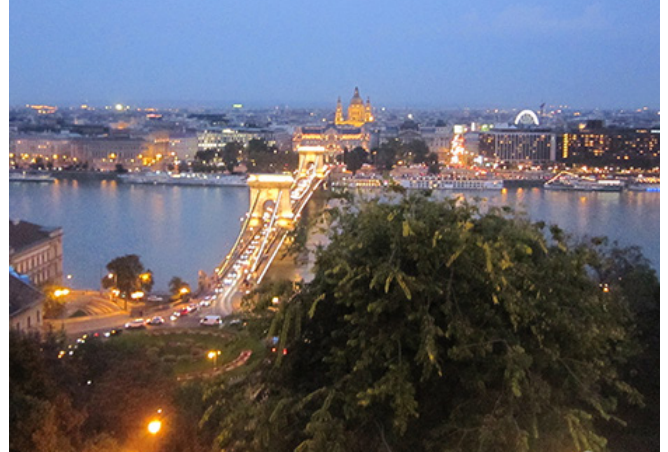
Budapest by night

One of the country's richest arboretums is located right in the middle of the city. It is a nature reserve and university campus in one. The garden is filled with book-clutching university