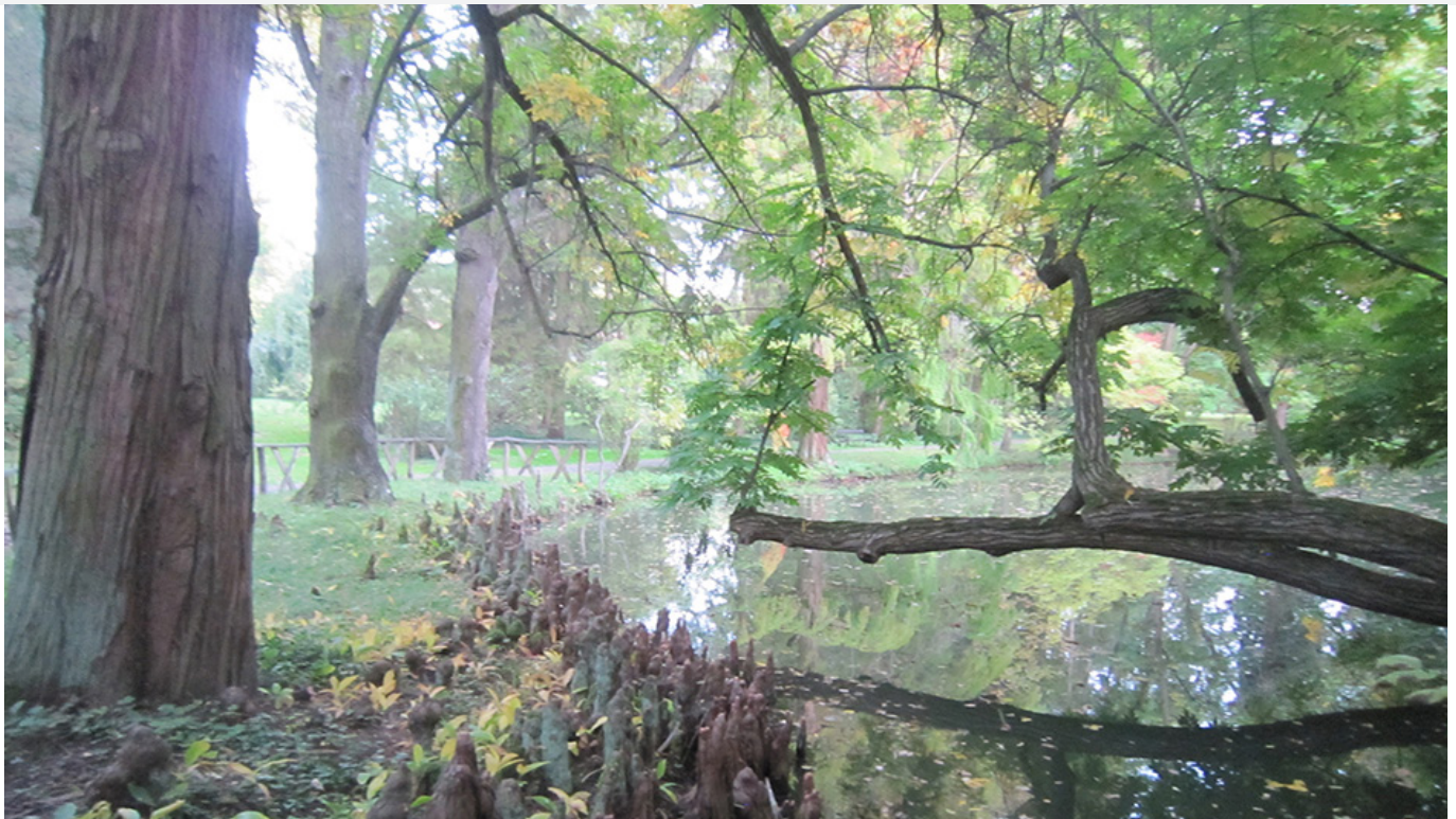
Taxodium, Vácrátót Botanical Garden