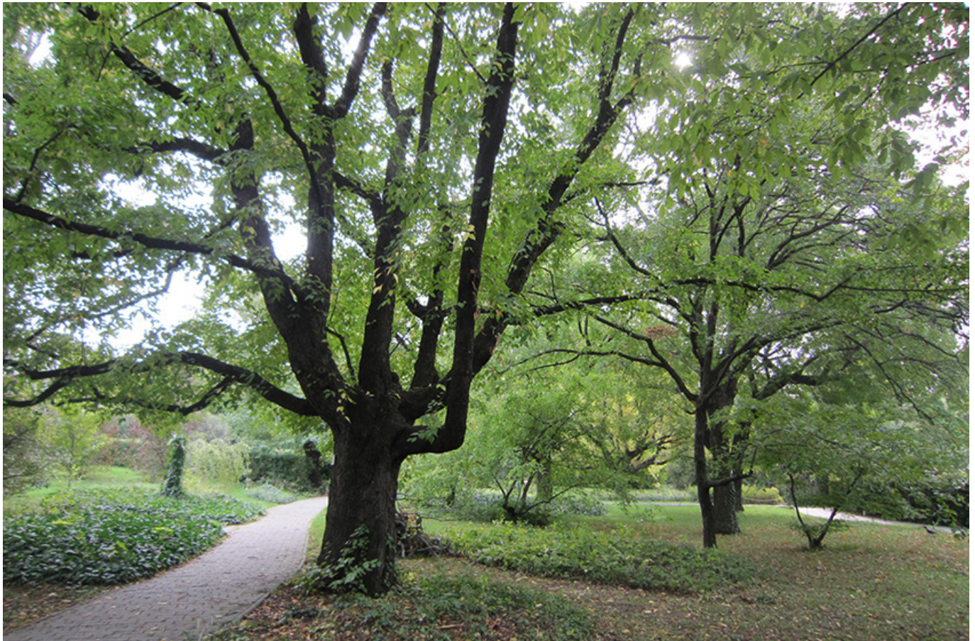
Ostrya carpinifolia , Budai Arboretum