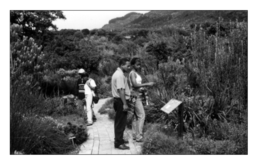
→ The Water-wise Demonstration Garden at Kirstenbosch NBG shows how you can have a lush, colourful garden without using lots of water. Interpretive signs explain the principles of waterwise gardening and suggest practical ways to save water in the garden.

• The Muthi Garden at Natal NBG features a traditional Zulu beehive hut surrounded by a collection of indigenous plants used for muthi (medicine). Posters inside the hut tell visitors about traditional healers, the big trade in medicinal plants and the over collection of plants in the wild which is posing a threat to some species.