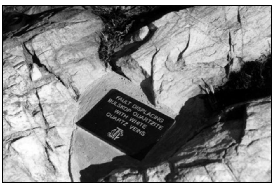
oldsymbol{\Omega} The Geological Trail at Witwatersrand NBG interprets the geological history of the area.