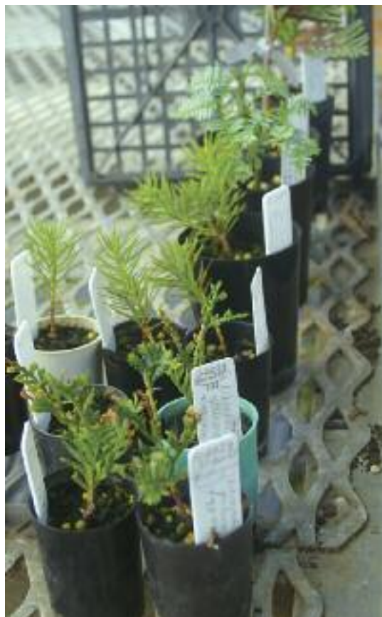
Conifer propagation at the Royal Tasmanian Botanical Gardens (RTBG)

The CBD web pages on the Nagoya Protocol: http://www.cbd.int/abs/