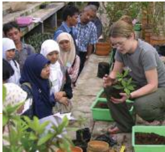
Demonstrating Rhododendron propagation at Cibodas Botanic Garden. (BGCI)

In recent years, increasing emphasis has been placed on integrated conservation approaches, in which in- and ex situ approaches are combined, often together with reintroduction and ecological restoration. The traditional idea that the role of botanic gardens was to hold cultivated stocks of threatened species during a period of habitat degradation, in what has been described as the “ark paradigm,” is no longer believed to be sufficient (Havens et al. , 2006). Rather, for botanic gardens to be