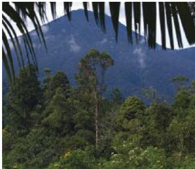
Cibodas Botanic Garden and surrounding vegetation (Kemal Jufri)