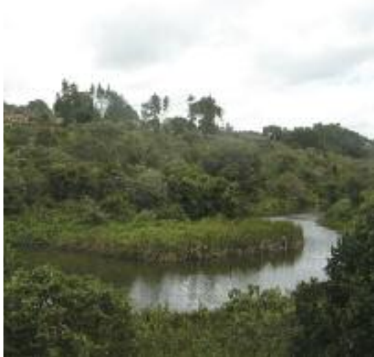
Forest restoration at Brackenhurst Botanic Garden, Kenya.

Collect seeds, cuttings, etc. from ex situ collections, such as seedbanks. Ensure that genetic diversity is maximised when deploying material, paying particular attention to species that have a “small neighbourhood” or experience outbreeding depression. Also consider the adaptive potential of the material to be planted. Genetic material that has been obtained from plants growing in environmentally similar sites to the reintroduction site, in terms of soil, climate, altitude and latitude, is more likely to be adapted to local conditions. Poorly adapted planting material is a major cause of failure of reintroductions.