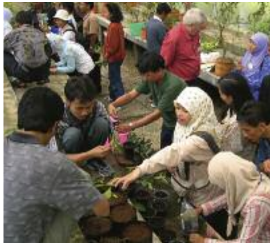
Practising Rhododendron propagation at Cibodas Botanic Garden.