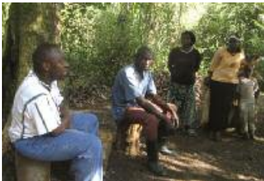
Tooro Botanical Garden – involving the community. (BGCI)

Another key issue is the need to monitor restoration progress, ideally as part of an adaptive management cycle (see Section 4.3.4). Many restoration projects neglect this important aspect. Once restoration targets or management goals have been identified, indicators will need to be developed to help track progress towards these goals. As a minimum, there will be a need to monitor the size and structure of the populations of reintroduced tree species, but the monitoring process might usefully be extended to include variables such as natural regeneration of young trees, extent of forest cover, presence of pollinators and seed dispersers, etc. Newton (2007) provides a comprehensive overview of techniques that can be used for monitoring of forest ecosystems.