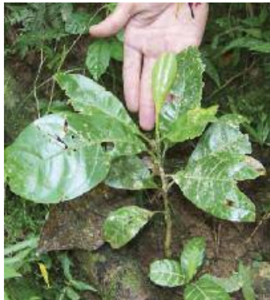
Magnolia silvioi seedling in the wild. (A. Cogollo)

In addition to such international policy initiatives, the CBD also requires individual countries to develop National Biodiversity Strategies and Action Plans (NBSAP). By October 2010, 171 of the 193 Parties to the CBD had developed NBSAPs. These are being re-aligned with the GSPC Targets and the overall 2020 biodiversity targets. Requirements for species conservation are included in the National Plans that provide a strong policy basis for tree restoration. Many additional countries have also developed additional policies or legislation promoting species protection and recovery, which may also relate to tree species.