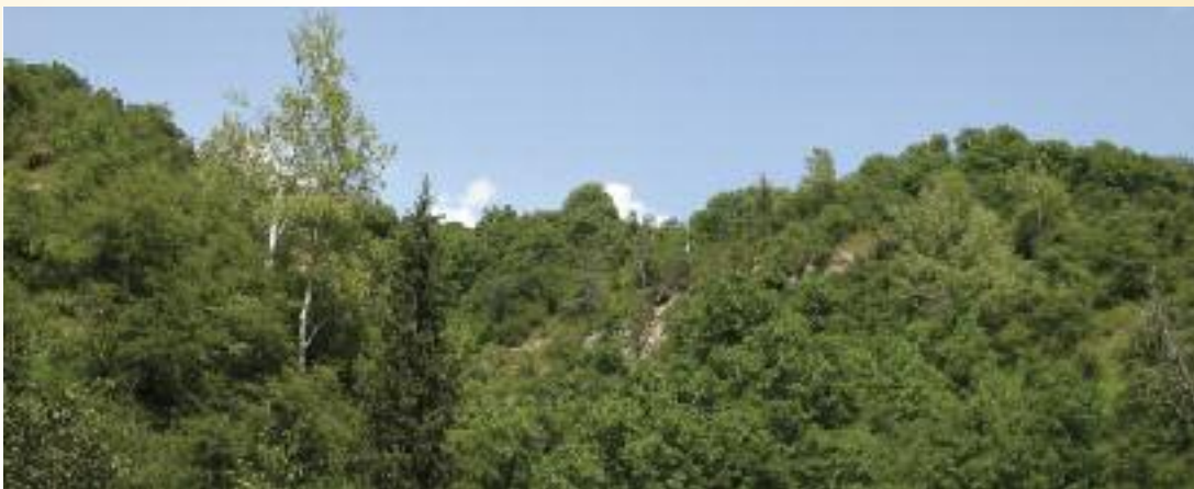
Walnut forest in Kyrgyzstan. (J. Gratzfeld)