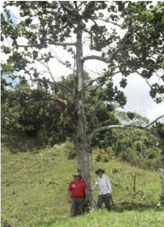
A remnant tree of Magnolia yarumalensis . (W. Buitrago)