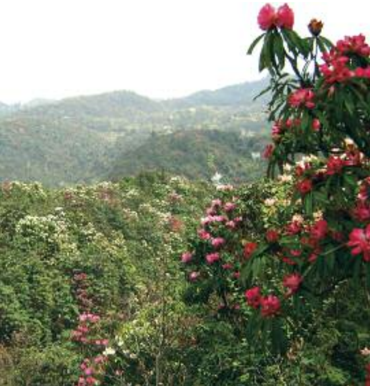
Rhododendron forest in Guizhou, China.

effective with respect to conservation, the species banking approach must be integrated with other conservation approaches focusing on habitats and ecosystems (Havens et al. , 2006).