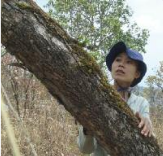
Community involvement in tree conservation. (BGCI)

point is that species may be dependent on a range of other species for their survival, including those involved in pollination, seed dispersal, and maintenance of a suitable growing environment. It may therefore be necessary to consider reintroductions of threatened species as just one element of an approach that aims to restore entire ecological communities or ecosystems. Some information on such approaches is also provided below.