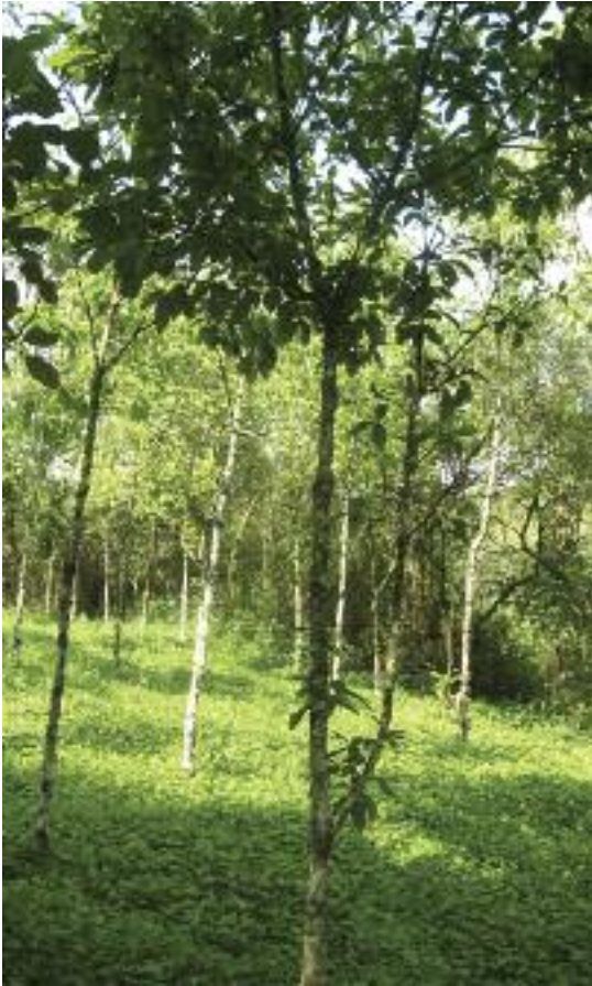
Prunus africana growing in Tooro Botanical Garden. (BGCI)