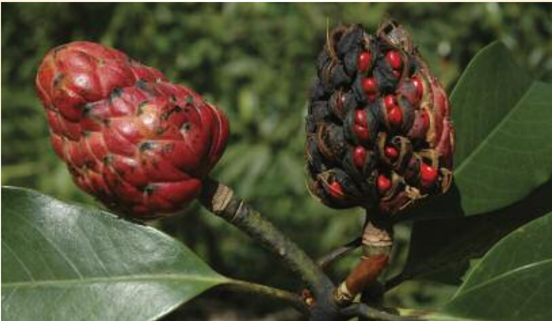
Fruit of Magnolia longipedunculata . (Zeng Qingwen)