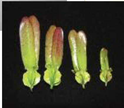
Left: Fruit of Dipterocarpus sarawakensis . (Wong, W.S.Y.)