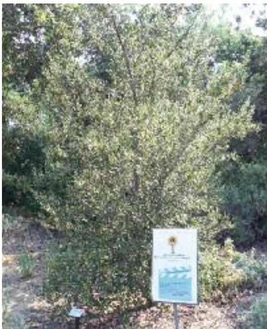
Cercocarpus traskiae at Rancho Santa Ana Botanic Garden (A. Kramer)

The New Zealand Plant Conservation Network: was established in 2003 with the vision that 'no indigenous species of plant will become extinct nor be placed at risk of extinction as a result of human action or indifference, and that the rich, diverse and unique plant life of New Zealand will be recognised, cherished and restored'. www.nzpcn.org.nz/