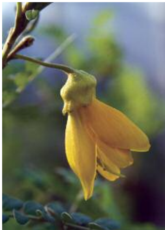
Sophora toromiro. (Magnus Lidén)

This manual builds on A handbook for botanic gardens on the reintroduction of plants to the wild published by BGCI in 1995 (Akeroyd and Wyse Jackson, 1995) and reflects the increasing imperative to restore and conserve damaged ecosystems. It draws on both the scientific literature and on practical experiences gained in tree conservation projects from around the world. We are grateful to a wide range of experts who contributed their knowledge and experiences, as acknowledged on p 01. The following sections first briefly consider why tree species should be conserved and restored, and how integrated approaches to conservation can be developed. A step-by-step guide is then provided to support the design and practical implementation of integrated conservation approaches. While this manual can only serve as a brief introduction to what is a large and complex subject, it is hoped that it will both facilitate and encourage botanic gardens and land management agencies to develop integrated conservation activities focusing on tree species.