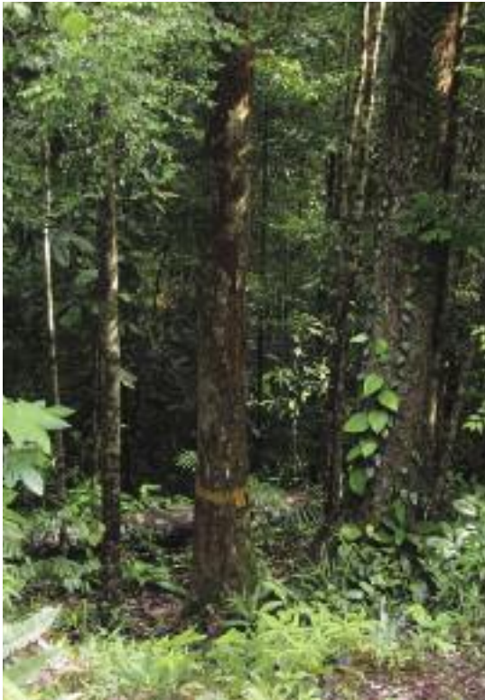
Dipterocarpus sarawakensis . (Wong, W.S.Y.)