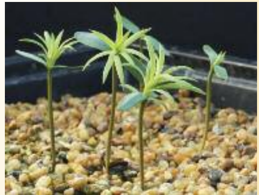
Xanthocyparis vietnamensis seedlings.