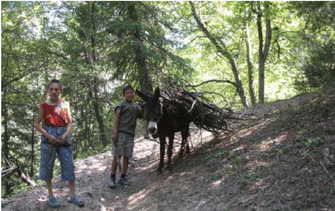
Fuelwood collection in the walnut forests of Kyrgyzstan. (J. Gratzfeld)