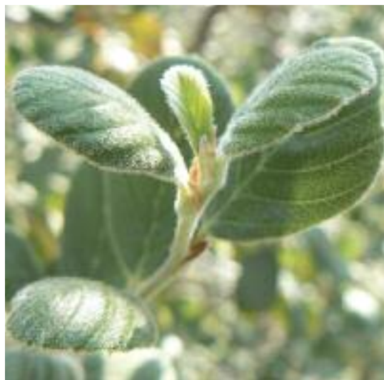
Cercocarpus traskiae . (A. Kramer)