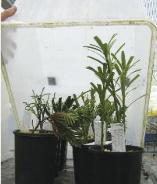
Above: Conifer cuttings in a closed case at the Royal Tasmanian Botanical Gardens (RTBG)