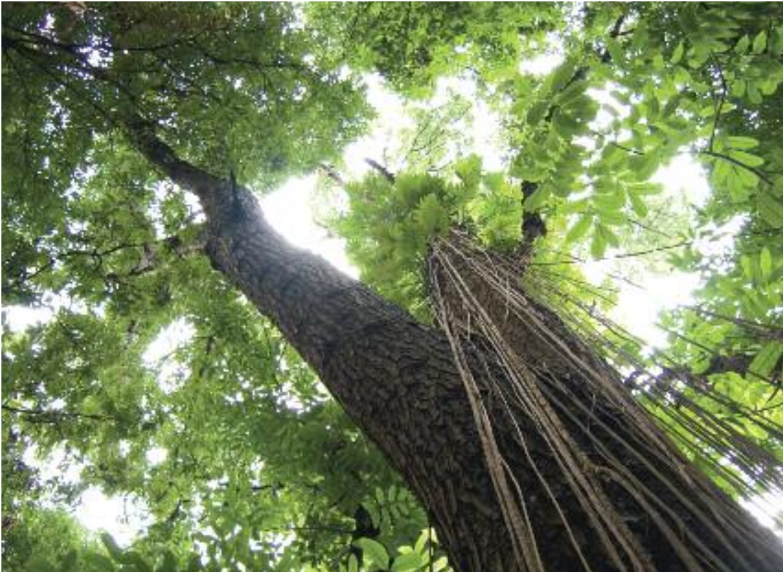
Mahogany growing in its natural habitat.

challenges. We hope this reference manual will be thought provoking and stimulate action. Access to financial resources may be challenging but the need for ecological restoration is becoming more widely recognised. Restoring tree populations and tree diversity is an essential component of this. The Global Trees Campaign a joint initiative of BGCI and Fauna & Flora International aims to conserve the world's most threatened tree species and their habitats. The recently launched Ecological Restoration Alliance of botanic gardens, coordinated by BGCI, brings together botanic gardens with a plan to restore 100 degraded and damaged ecosystems worldwide. Please join us in sharing your experiences and taking action to conserve and restore the world's imperilled trees.