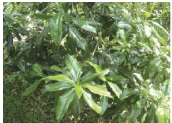
Warburgia – a medicinal tree valued in Africa.

Integrated conservation of tree species therefore includes both in situ and ex situ action, linked by restoration, reintroduction and collection, to support species survival. This process can be supported by research, horticulture and education that can ultimately increase the success of conservation efforts (Figure 1). Botanic gardens and related organizations can play a major role in integrated plant conservation throughout the world, and are uniquely positioned to be able to support such efforts (Havens et al. , 2006).