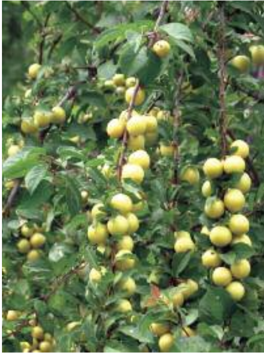
Prunus sogdiana . (BGCI)