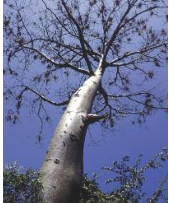
Ceiba trichistandra a tree of threatened tropical dry forests in Ecuador. (BGCI)

demand for change. Bringing about such change often requires tenacity and a rather visionary view of possible long-term solutions. Creation of an NGO is often a useful way of furthering a particular cause, which can unite those who share common interests.