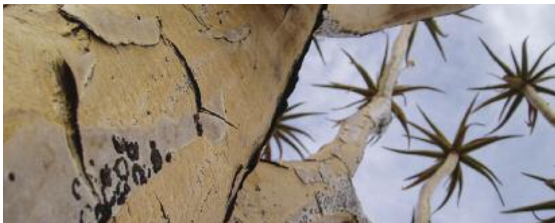
Aloe dichotoma (SANBI)