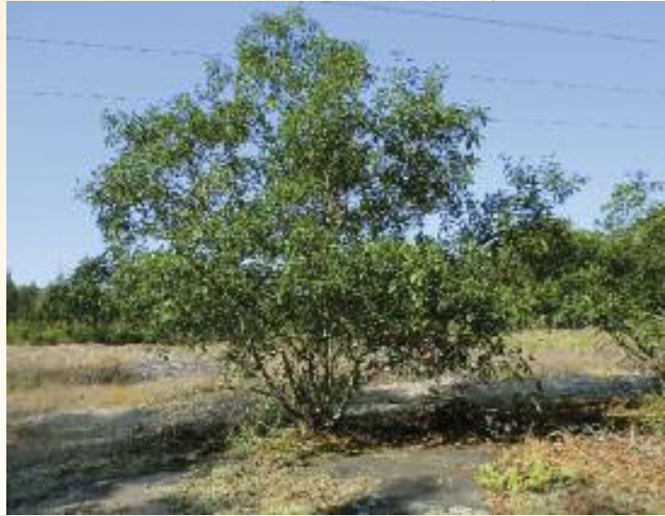
Quercus georgiana . (A. Kramer)

Project partners are working with the botanic gardens and arboreta curating living collections of these species in the United States to carry out genetic studies and micropropagation trials. BGCI's PlantSearch database was used to locate the species in ex situ collections. The aims of the project are to: