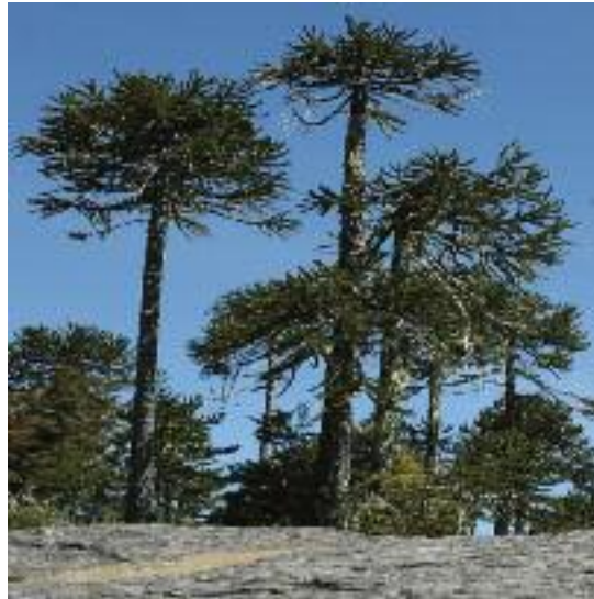
Araucaria in Conquillo National park, Chile

The widespread loss and degradation of native forests is now recognised as a global environmental crisis. From 2000-2005, global forest area declined by around 20 million ha/yr (Hansen et al. , 2010), with undisturbed primary forest declining by an estimated 4.2 million hectares (or 0.4%) annually (FAO, 2010). The loss and degradation of forest ecosystems resulting from human activity are major causes of global biodiversity loss (UNEP, 2009; Vié et al. , 2009). Clearance of forest for agriculture, mining, urban and industrial development all contribute to the loss of forests and tree species in the wild. Management activities within forests, including burning, logging and overgrazing also impact on forest structure, functions and processes and can additionally contribute to the loss of tree species. Climate change is an additional over-arching threat, which may particularly affect