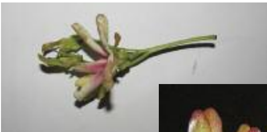
Above: Flower of Dipterocarpus sarawakensis , a species that is Critically Endangered in Peninsular Malaysia. (Wong, W.S.Y.)