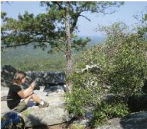
Collecting field data on Quercus georgiana.

To address this, BGCI US has undertaken a project with the US Forest Service, Cincinnati Zoo and Botanical Garden's Center for Research of Endangered Wildlife, and Longwood Graduate Program to understand the conservation value of current living collections of four threatened oak species. The project is also undertaking research that will improve options for ex situ conservation of these study species and other globally threatened oaks. The species include: Q. acerifolia (Endangered), Q. arkansana (Vulnerable), Q. boyntonii (Critically Endangered), and Q. georgiana (Endangered). Among other threats, the continued survival of these species is increasingly threatened by a combination of stresses relating to climate change and the advance of Sudden Oak Death ( Phytophthora ramorum ), making ex situ conservation an important conservation priority.