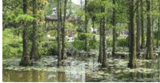
Wuhan Botanic Garden. (BGC)