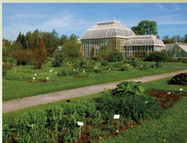
Kaisaniemi Botanic Garden, central Helsinki, Finland.

Best practice at FMNH is to select acquisitions capable of fulfilling a number of different acquisition criteria. These are termed 'multifunctional accessions' once in the collection. In so doing, the same accession used for display and education can also be utilised for research and conservation.