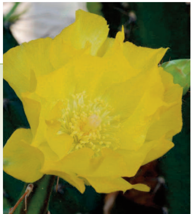
Opuntia stenarthra , discovered in the cacti collection of the Botanic Garden Meise during an evaluation of the conservation value of the plant holdings.

This evaluation type is not a quick and easy procedure. It evaluates associated accession data and concentrates on the potential usefulness of plants for conservation and research. If a botanic garden's aim is to improve the value of its holdings then this type of evaluation should be part of its ongoing curation agenda (Case study 3.5).