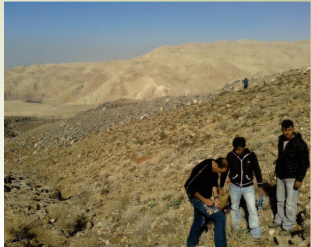
Collecting vegetative material for propagation at RBGJ from a highly grazed location on Mount Nebo, Jordan.