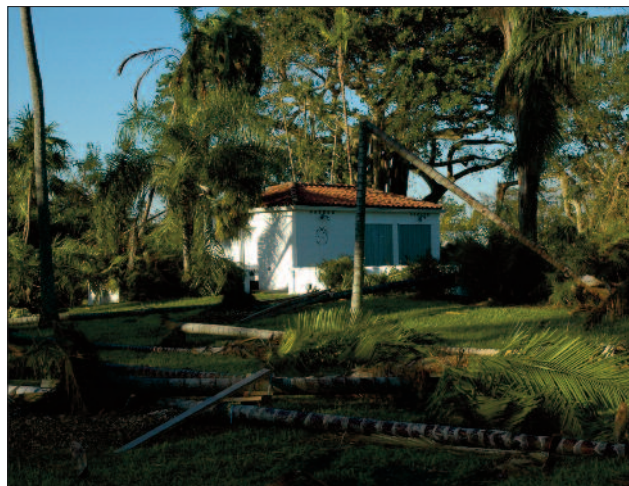
Montgomery Botanical Center, Florida – the day after Hurricane Wilma which destroyed half of its wild-gathered Syagrus botryophora palm collection.

Similarly, the International Conifer Conservation Programme at the Royal Botanic Garden Edinburgh has developed a network of over 200 'safe areas' for the cultivation of threatened conifers throughout