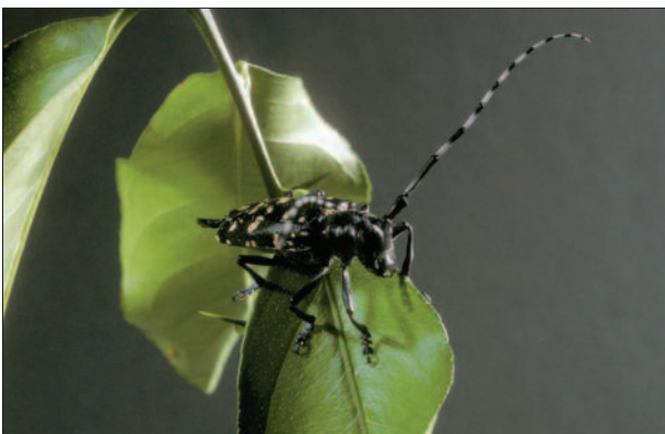
Fairy Lake Botanical Garden, CAS, Shenzhen, China, is specialised in research into the Asian longhorn beetle ( Anoplophora glabripennis ) to develop effective control strategies and policies. This species has been introduced to the United States in the mid 1990s, causing havoc outside its natural range to a number of trees including poplars, maples, willows and birches.

Curators should adopt routine monitoring to investigate the risk of the spread of exotic plants both within and in the area surrounding the botanic garden. Major guidance for developing a botanic garden policy on invasive plant species is provided by the Invasive Plant Species Voluntary Codes of Conduct for Botanic Gardens and Arboreta and the European Code of Conduct for Botanic Gardens on Invasive Alien Species (Heywood and Sharrock, 2013).