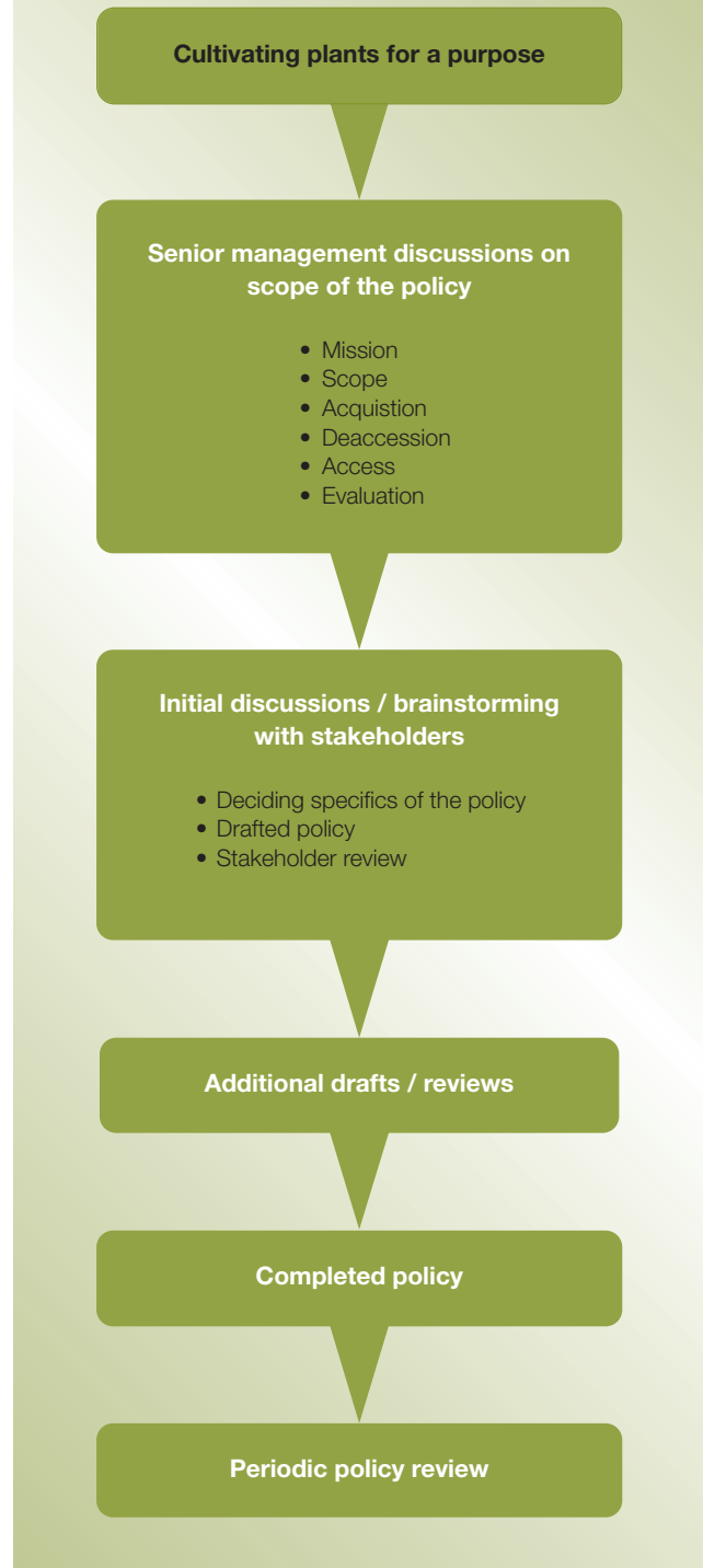
Figure 3.1 Development stages of a collection policy

Following the distribution of the final draft to all stakeholders, a further stakeholder meeting will be convened where the final draft document is presented. This will allow an opportunity to resolve any outstanding issues prior to completing the collection policy.