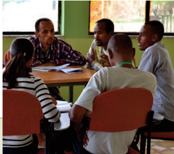
Staff of the Ethiopian Biodiversity Institute share ideas for developing a collection policy for Shashamene Botanic Garden during a BGCi training workshop.

3.1). A typical collection policy will provide specific advice on the acquisition and transfer of material and standards of documentation, and may include specific topics, such as 'Collection of plant material in the field' and 'Procedure for labelling'. The collection policy often interconnects with areas beyond the direct responsibility of the living collections, for instance with the herbarium or the botanic garden's approach to interpretation (Chapter 7, Section 7.3). For this reason, it is important for all stakeholders involved in collection management to contribute to setting the scope of the collection policy prior to its development (Case study 3.1).