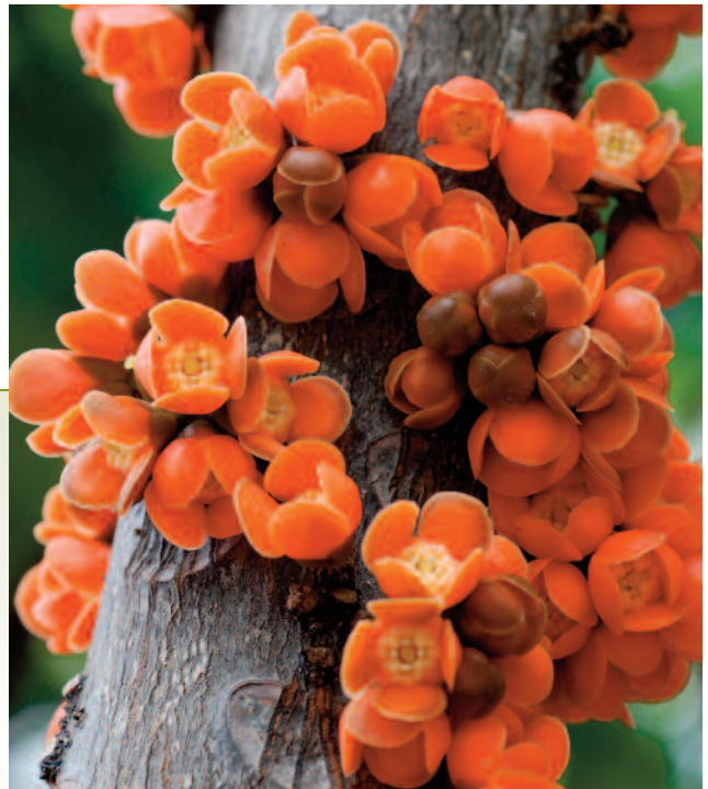
Clavija cauliflora grown at the Botanic Garden Meise – initially identified via photographs.