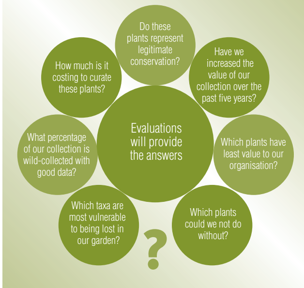
Figure 3.3 Collection management questions that evaluations aim to answer