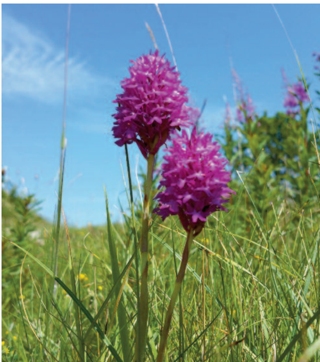
Showcasing native orchids in the 'wild' areas of botanic gardens.

Various ways of acquiring plant material exist, including collection from natural habitats, exchange between botanic gardens, donations from private collections or purchase from commercial enterprises. Prior to being formally accepted into the botanic garden collection, the plant material is termed 'acquisition'. This is defined as an