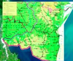
The Romanian Seashore of the Black Sea

It is known that this species has a high content of iodine, bromine, potassium salts and alginates and for this reason we considered it necessary to perform a series of thoroughgoing phytochemical studies in order to identify the chemical compounds responsible for the abovementioned effects.