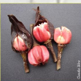
Erythronium brasiliensis Nees & Mart.