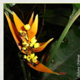
Heliconia angusta Vell.