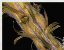
Sarcoglottis fasciculata Schltr.