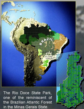
The Rio Doce State Park, one of the remnants of the Brazilian Atlantic Forest in the Minas Gerais State.

The Botanic Garden of the Fundação Zoo-Botânica de Belo Horizonte, Brazil, develops cultivation studies with native species and environmental education actions according to conservation policies. The Brazilian Atlantic Forest is one of the 25 biodiversity hotspots in the world. This project consisted in cultivation experiments with species from Rio Doce State Park, one of the remnants of this biome in the Minas Gerais State.