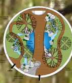
The Atlantic Forest Glasshouse: a new project