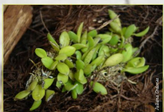
Pleurothallis graveolens Pabst