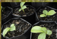
Seedlings of Costus scaber Ruiz & Pav.