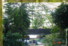
The Atlantic Forest Glasshouse