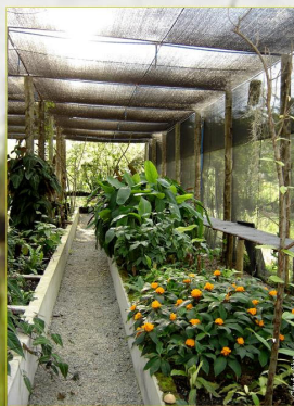
Greenhouse where the seedlings are maintained

The success in cultivation allows maintenance of an ex-situ germoplasm bank that will be used to assembly an exposition on a glasshouse focusing the Atlantic Forest, where environmental education activities will take place.