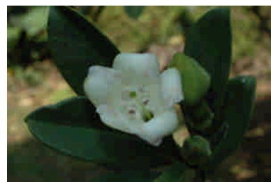
Rare and endangered plants collection in Heng-chun Tropical Botanic Garden

Variations range and patterns were studied for each species before number and collecting methods being decided for conservation purpose by means of RAPD or ISSR techniques. Field gene bank has been established in the 52ha experimental sites of the garden. So far 12ha gene bank including 4 species of rare and endangered plants has been set up.