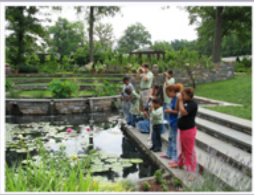
Children's Educational Programs

Conservation lectures and field trips for the public focus on the need for increased awareness of the threats to native ecosystems throughout the southeastern United States. Interpretive signage placed throughout the Garden helps foster an understanding of the many factors driving the downward trend in global biodiversity. Plans are currently being developed to realize the educational potential of the internet for the Sarah P. Duke Gardens. An improved website will focus on connecting the world with our conservation efforts through audio tours and other enhanced content.