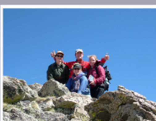
National Conferences BGCI/CPC Conference Denver, CO 2004