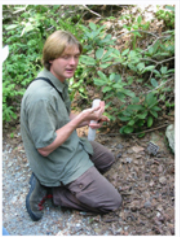
Educational field trips