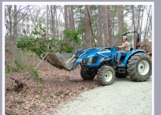
Invasive Species Removal