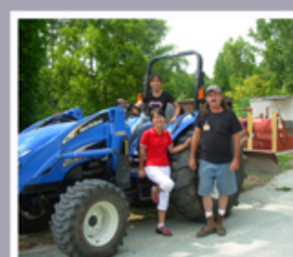
International Internships Students from Guizhou Botanical Garden 2006