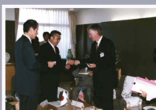
International Cooperation Toyama, Japan 2005