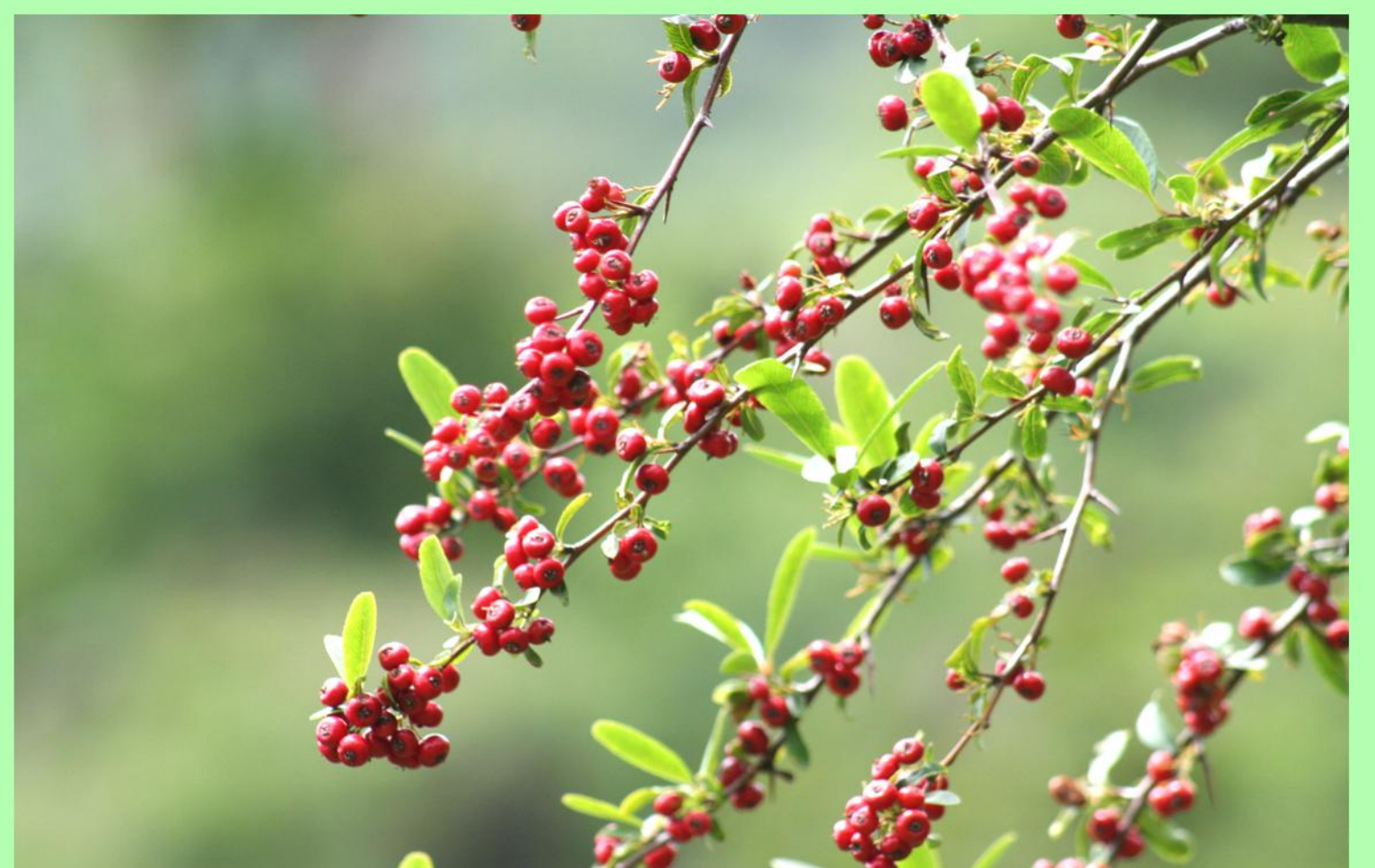
Conservation of Himalayan Flora