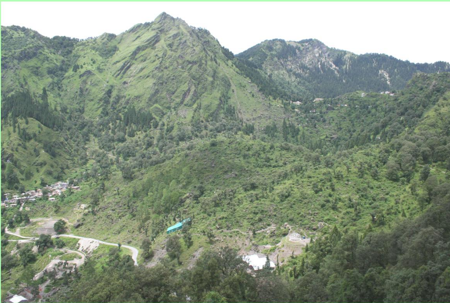
Aerial view of the Botanic Gardens