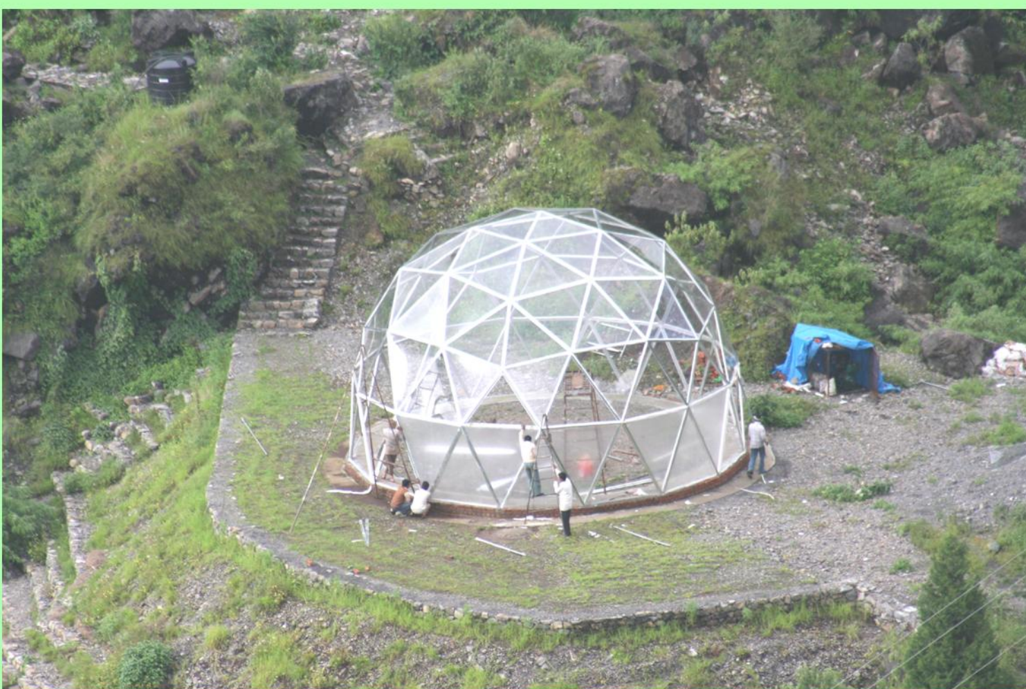
Geodesic dome under construction