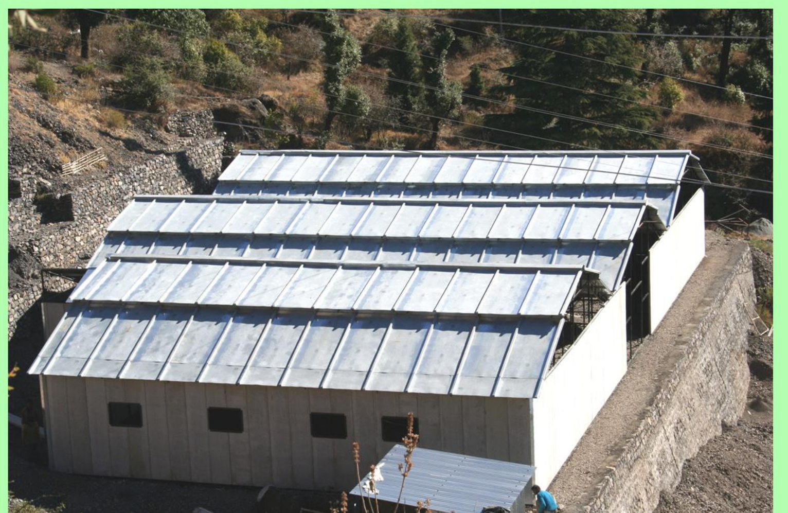
Auditorium, Library and Herbarium