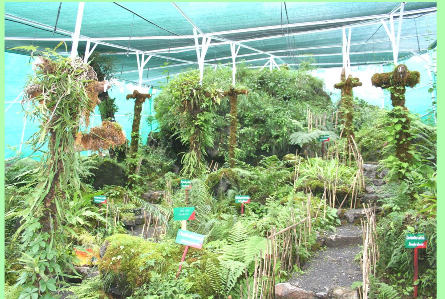
Fernarium and Orchidarium