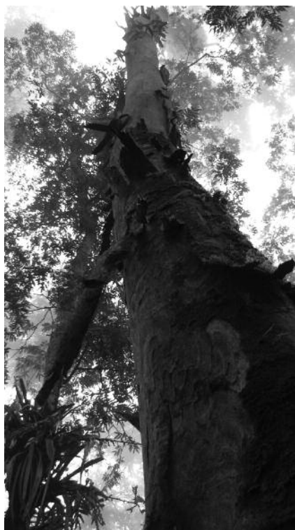
Upwards view of the trunk of an Oreomunnea mexicana tree with epiphytes, mosses and lichens in a cloud forest stand in central Veracruz.

The cloud forests of Mexico are immensely valuable for the ecosystem goods and services that they provide. The forests are exceptionally rich in botanical diversity with over 2,800 plant species recorded within them. The diversity of tree species, approximately 25% of the total botanical diversity, defines the forest structure and contributes to the ecological function and resilience of the forests. The trees also provide a wide range of products valued by local people. Unfortunately the cloud forests of Mexico, as elsewhere in the world, are under severe threat. The component trees are also threatened with extinction to a varying degree. This report presents a review of the conservation status of the Mexican cloud forest trees, undertaken by Mexican experts in partnership with FFI and the IUCN/SSC Global Tree Specialist Group. It is the result of a remarkable collaborative process over four years bringing together botanists and ecologists who care about the future of the forests and trees of Mexico.