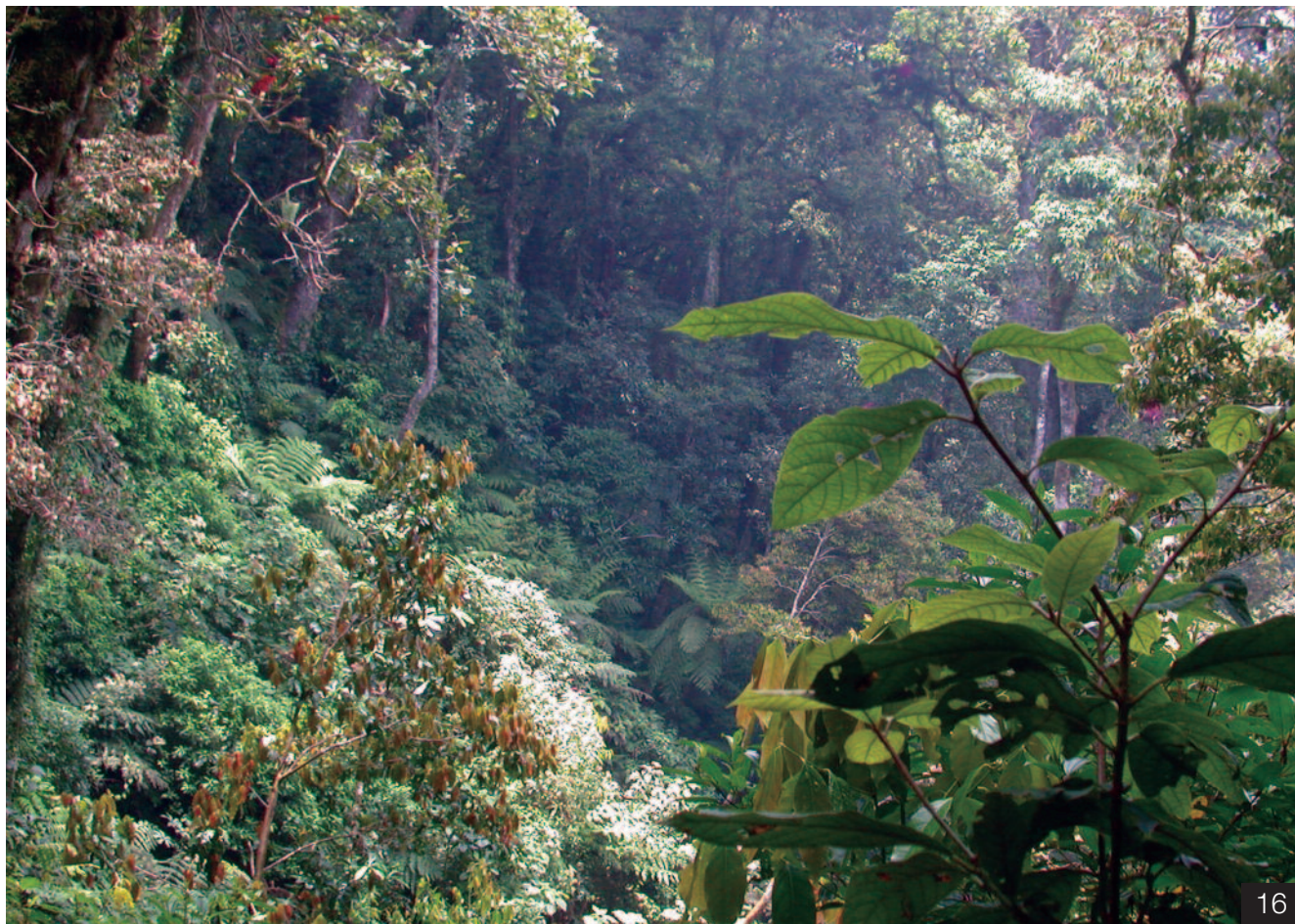
16. A steep slope of cloud forest in Bachajón, Chiapas, southern Mexico.