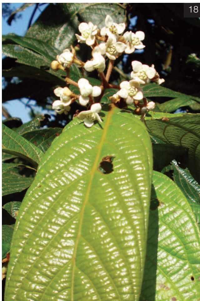
19. Oreomunnea mexicana (Juglandaceae). An endangered very tall tree found in a few wet places of cloud forest. Branch with fruits.