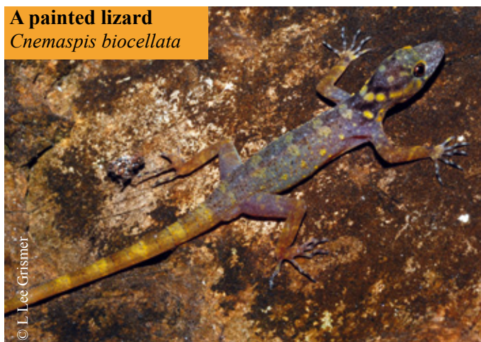
A painted lizard Cnemaspis biocellata

The species are generally nocturnal, but can be glimpsed by day in the shaded surfaces of large rocks and tree trunks. When encountered by scientists, the lizards were amazingly quick and agile. The name of the species, biocellata , derives from “two” and “little eye” and refers to the two small ‘eyes’ on the ‘face’ pattern that is displayed on the back of the gecko’s head.