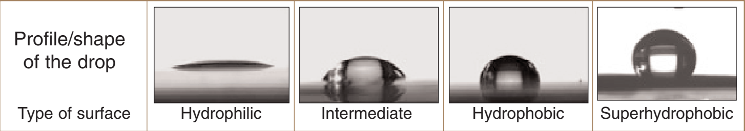
Table 1: Hydrophilic - Hydrophobic surfaces