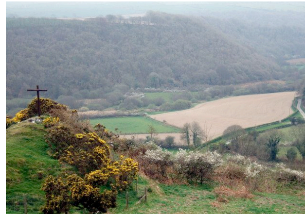
View of Cwm Gwaun, UK from nearby Christian retreat