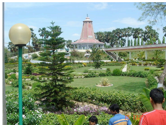
Kuppaghat Ashram, India By Praveshksingh