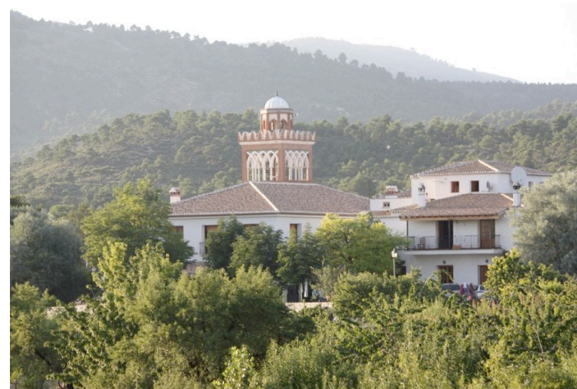
Alqueria de Rosales, Islamic retreat, Spain By Riyadh Minty