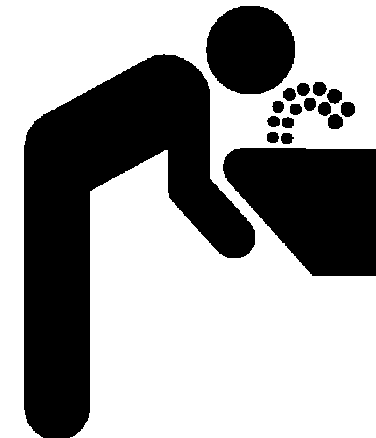
Sign for drinking water By OCAL