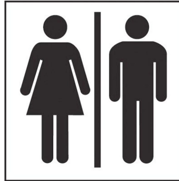
Sign for toilets By OCAL