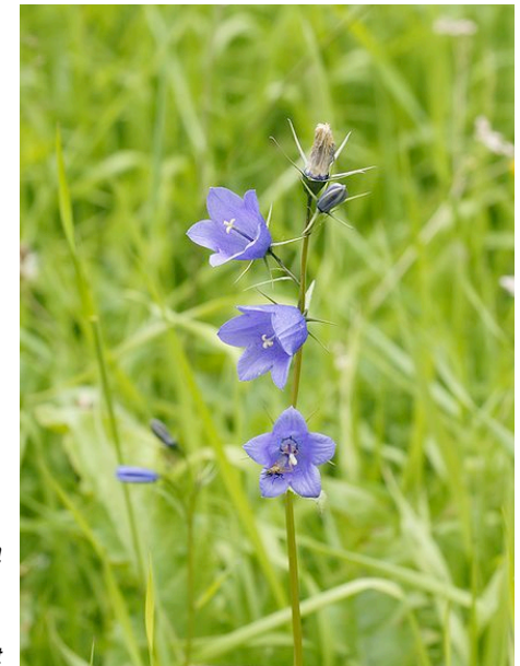
Harebell Campanula rotundifolia English common name: harebell Scottish common name: bluebell