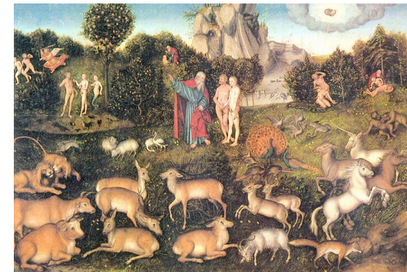
Paradise, Lucas Cranach 1536