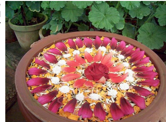
Rangoli made with petals and floating on water