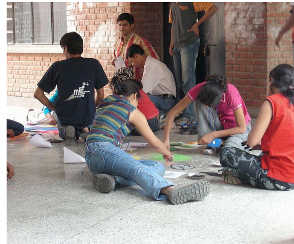
Working together to create Rangoli for a college competition in Kanpur, India