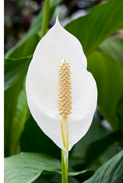
Peace lily Spathiphyllum cochlearispathum English common name: peace lily Japanese common name: nioi-sasa-uchiwa fragrant bamboo fan By JJ Harrison