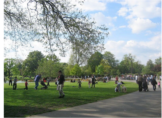
People enjoying a day out in Regent's Park, London, UK By Umezo KAMATA