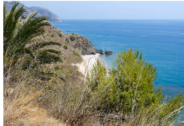
Beach and coastline near Salobrena, Spain