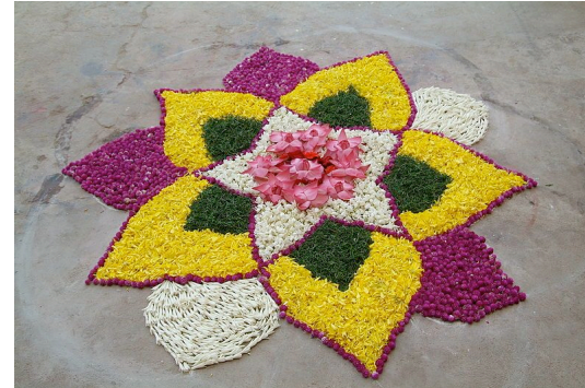
Rangoli made with flower petals in Chennai, India