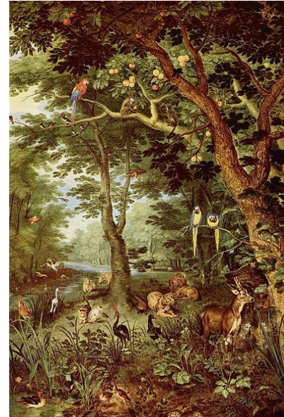
Das Paradies, Jan Brueghel circa 1620