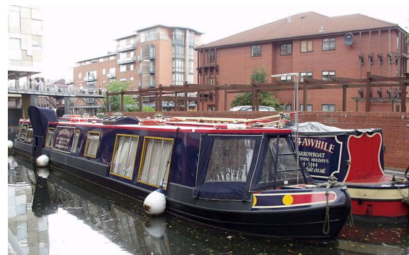
View of canal boats in Birmingham, UK By Elliott Brown