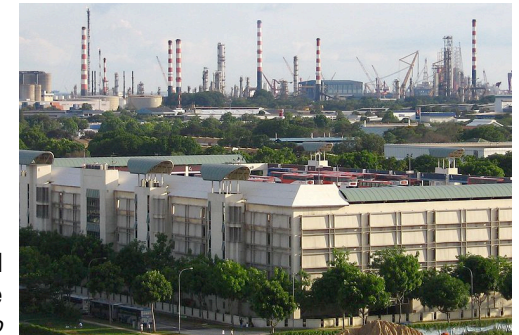
View of factories and shipyards in Singapore By Calvin Teo