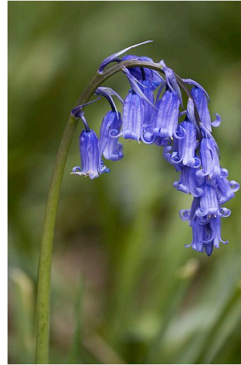
Bluebell Hyacinthoides non-scripta English common name: bluebell Scottish common name: wild hyacinth or bluebell by MichaelMaggs

Resource 5: Images of bluebell, harebell and peace lily