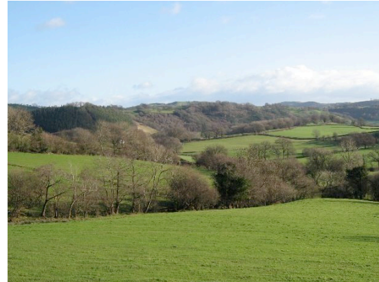
View of rolling hills in Wales, UK