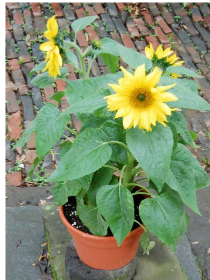
Plant growing in a pot. By InAweofGod'sCreation