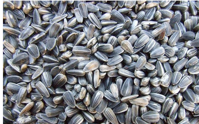
Sunflower seeds. By cyclingshepherd

Resource 2: Images of seeds and pots with plants and no plants growing