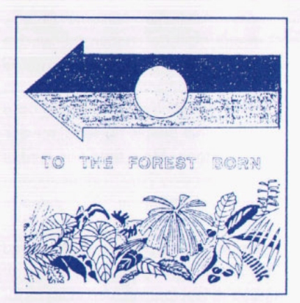
Sign made for To the Forest Born

The cast painted the children's faces and taught them a number of traditional dances. The children also learnt how to play a toy didgeridoo, using plastic pipes. These were highlights of the show and gave children some insight into the ceremonies of Aboriginal people.