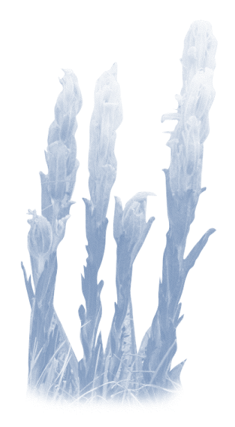
Castilleja levisecta, Golden Paintbrush Canada. COSEWIC: Endangered U.S. ESA: Threatened

An estimated $30 billion a year is spent to control invasive non-native plants in the U.S. alone.