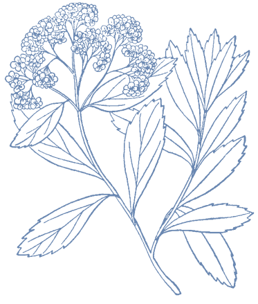
Spiraea virginiana, Virginia Meadowsweet U.S. ESA: Threatened

E6. Botanical gardens and their networks better share and promote existing information and resources on how to achieve plant conservation objectives.