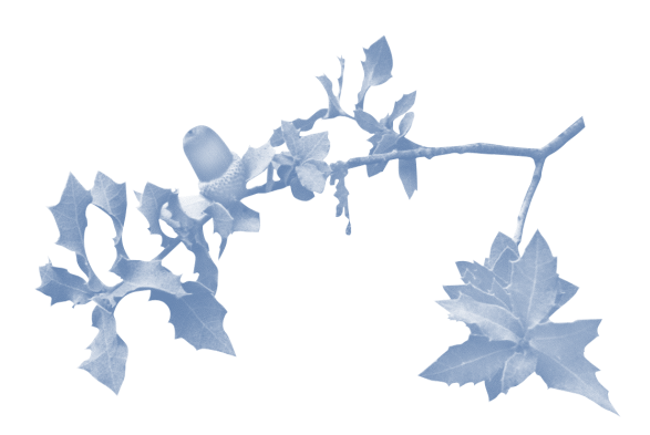
Quercus hinckleyi, Hinckley Oak Mexico. IUCN: Critically Endangered U.S. ESA: Threatened