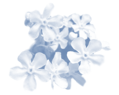
Hackelia venusta, Showy Stickseed U.S. ESA: Endangered

Subtarget 2 : 20% of botanical gardens in the United States are partners in formal recovery planning for species in their regions.