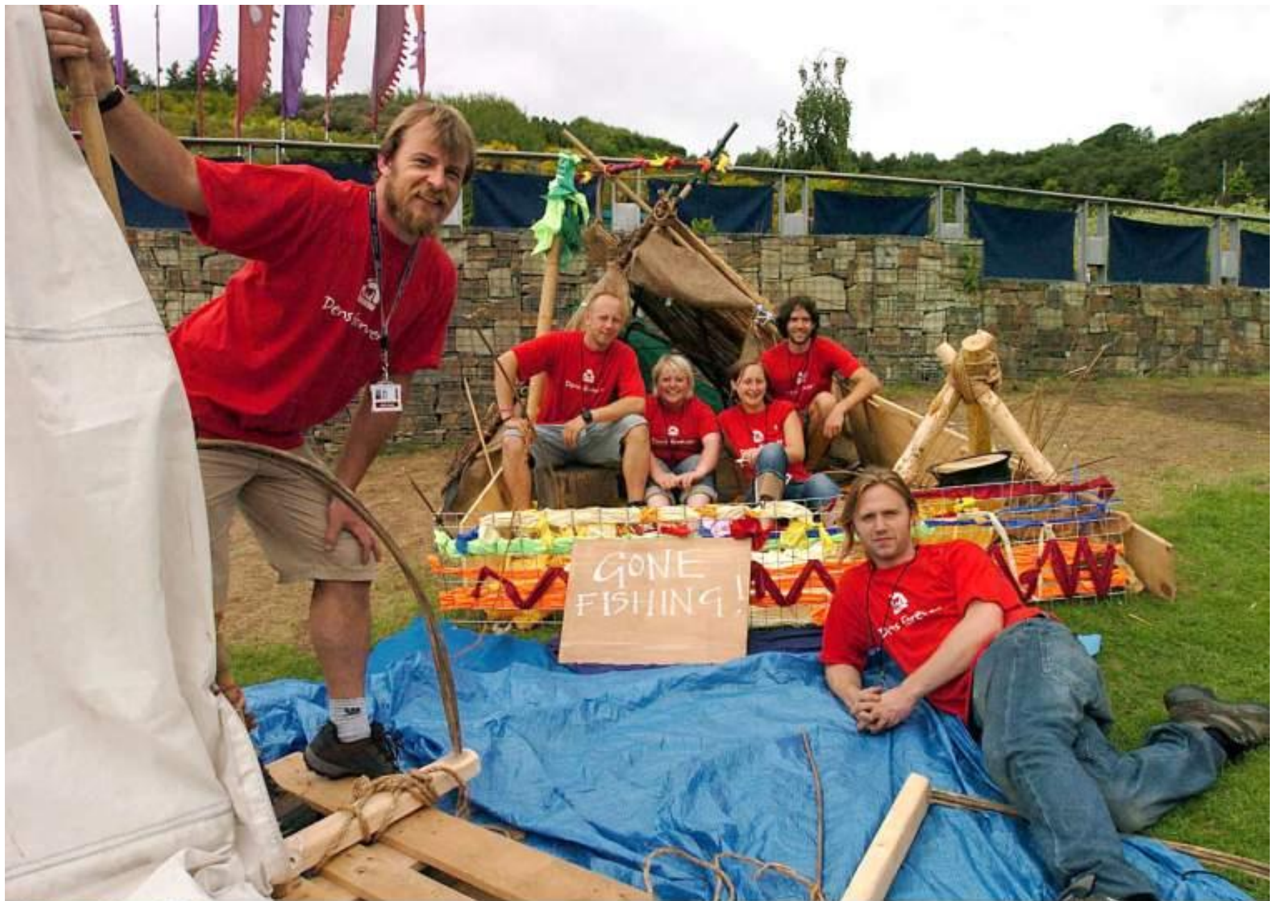
03/08/07 Eden Project-Den Challenge Eden team members with one of the dens