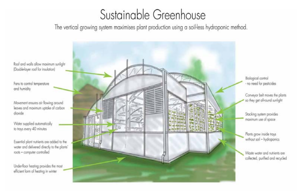
Figure 3. VertiCrop<sup>™</sup> exhibit interpretation at Paignton Zoo showcasing sustainable food production

or no carbon expended in between crop production and delivery, as transportation will be eliminated and therefore the environmental costs are reduced to a lower level than would otherwise be the case. The zoo exhibit is housed within a low energy polythene structure that has is double skinned with a smart polythene film on its roof to retain heat, reduce scorch and provide optimal light levels in winter months (Chester, 2010). Rain water is harvested from the roof and under floor heating is used to provide minimum winter temperatures. Further reductions can be made through integration of compatible green technologies to generate and efficiently utilise the energy required to operate it. These include biogas, solar thermal, air, ground and gas source heat pumps, photovoltaic, geothermal and wind power. The resultant exhibit has the potential to require no carbon-based energy and provides the organisation with a reduced ecological footprint that can be communicated to its visitors in a visually graphic and physically ingested way, through literally eating the view.