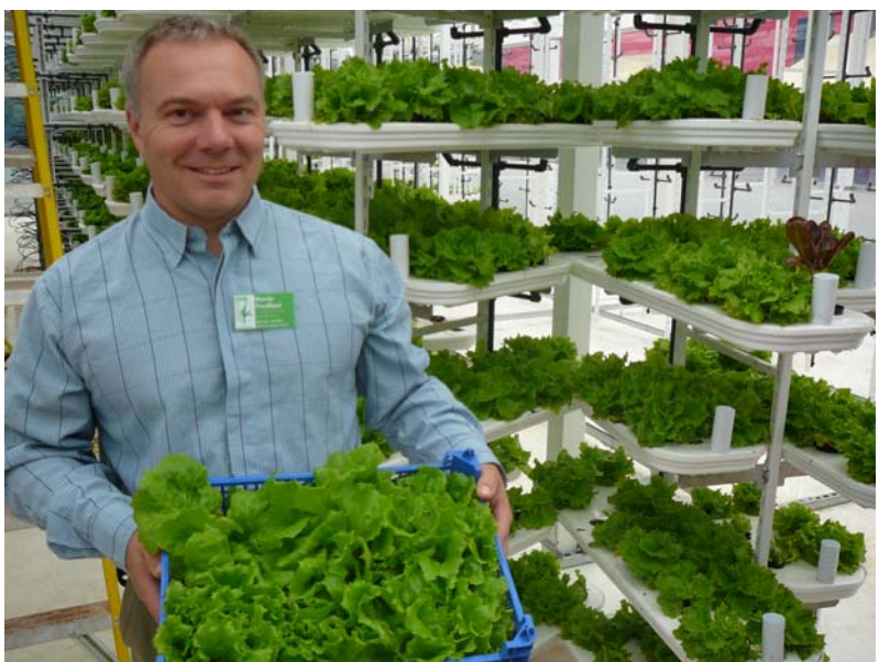
Figure 2. The VertiCrop growing production system with its first crop of lettuces