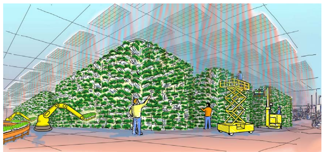
Figure 4. VertiCrop<sup>™</sup> is a modular high density growing system suited to serving the needs of an urban agriculture.

Vertical growing is compatible with existing hydroponics and greenhouse technologies and can embrace emerging sustainable technologies such as LED and Plasma lighting. Together these solutions address many aspects of the sustainable urban production challenge (i.e., soil-free, organic production, closed loop systems that maximize water and nutrient efficiencies, etc.). Such systems have major potential for the realization of environmentally sustainable urban food and fuel production to benefit human kind and have a very real place to play in adding value to society through zoo and botanic garden horticulture in the 21<sup>st</sup> century.